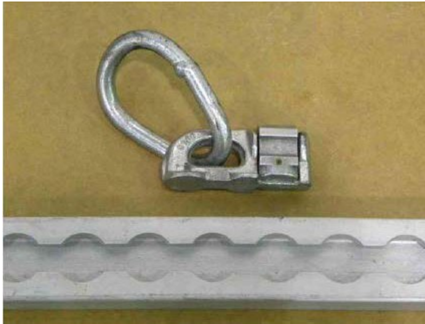
FIGURE 3. TETHER RESTRAINT USAGE