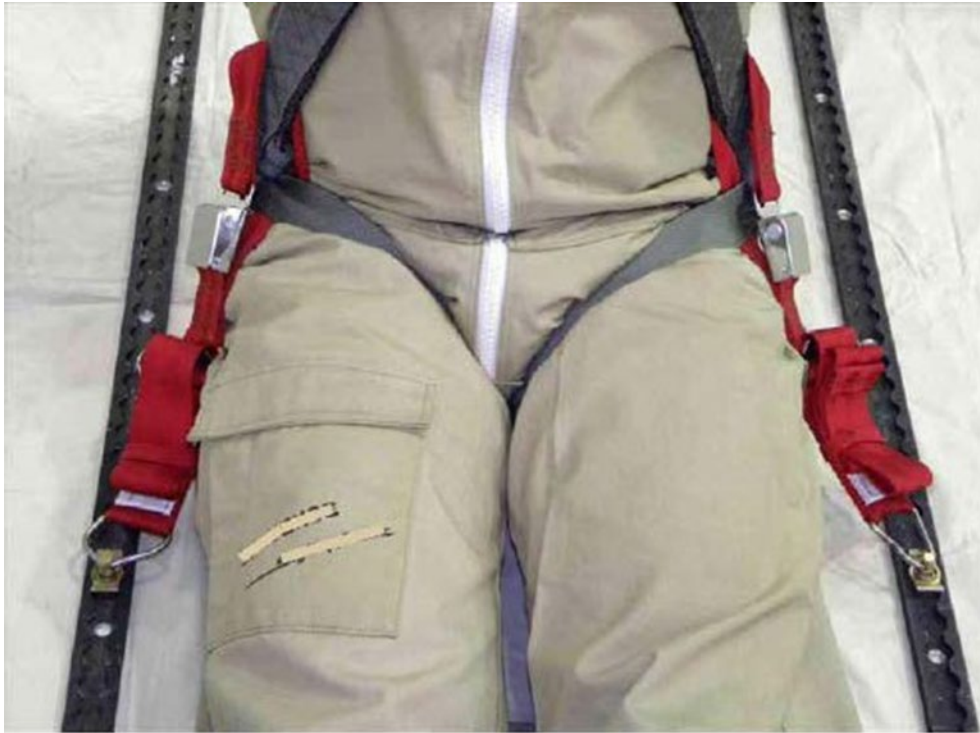
FIGURE 9. DUAL POINT, DUAL TETHER RESTRAINT ATTACHMENT TO FLOOR FOR REAR-FACING STRADDLE