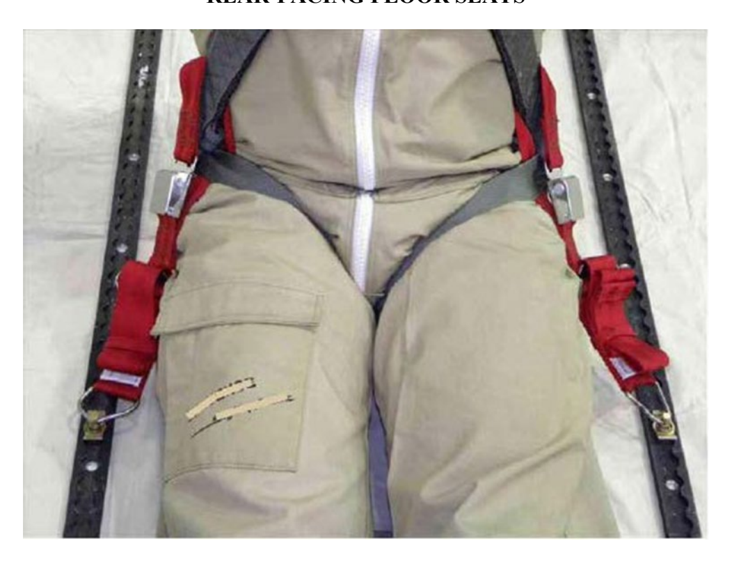
FIGURE 9. DUAL POINT, DUAL TETHER RESTRAINT ATTACHMENT TO FLOOR FOR REAR-FACING STRADDLE