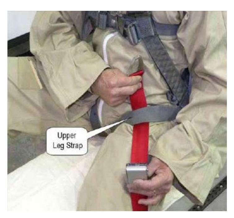
FIGURE 5. PASS TETHER LOOP UNDER MAIN LIFT WEB