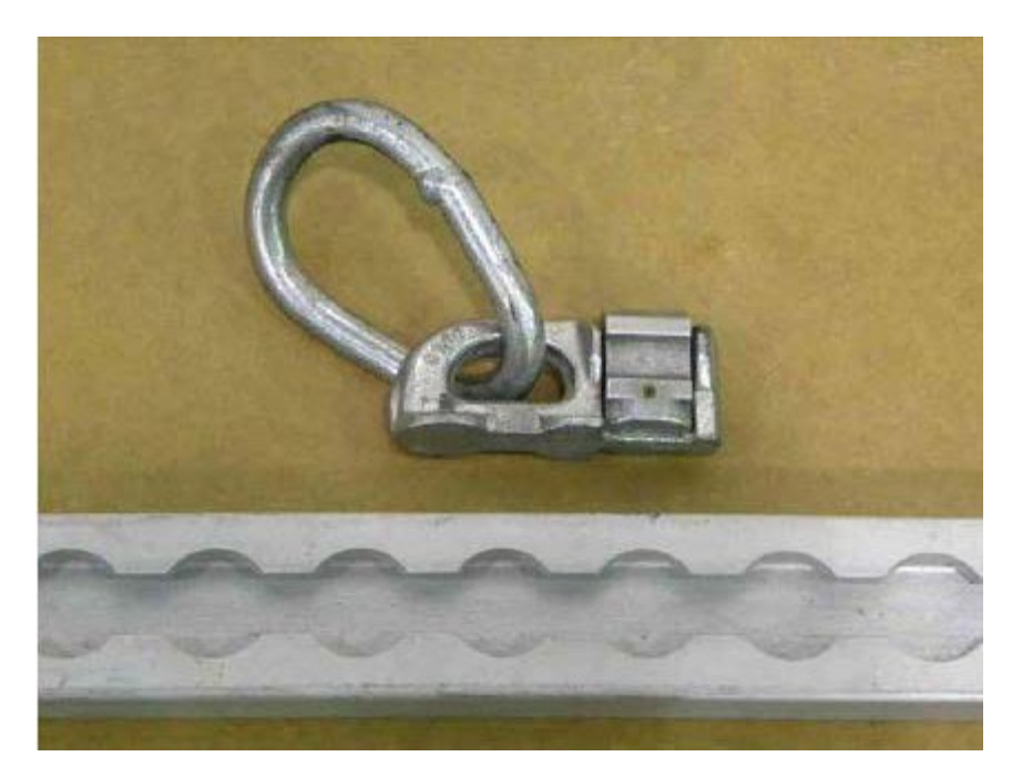
FIGURE 3. TETHER RESTRAINT USAGE